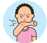
Continuous or persistent cough