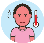
High temperature (above 37.8 °C)